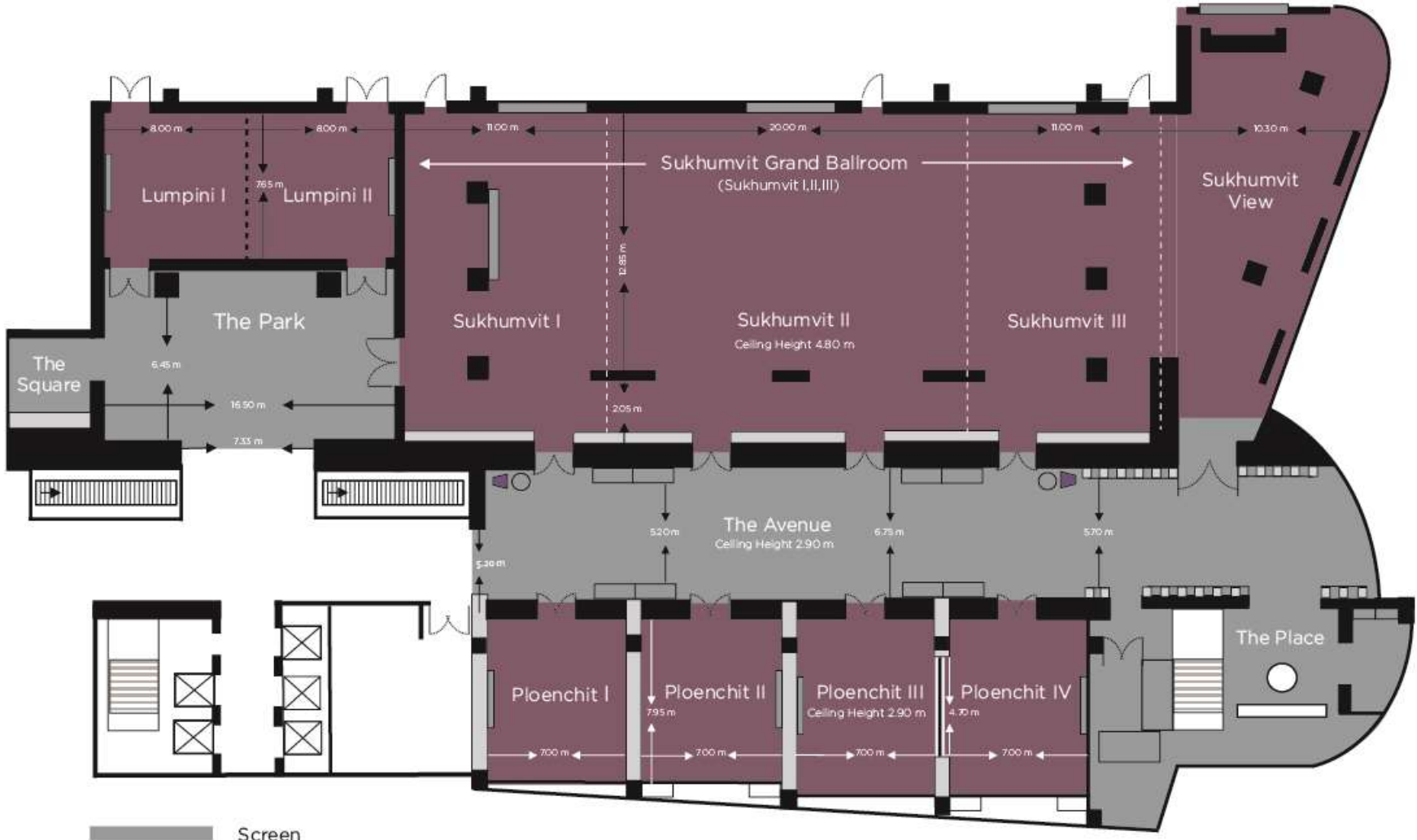
Meeting Facilities : 3 rd Floor